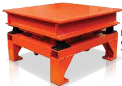
LOW PROFILE COMPACTION TABLE