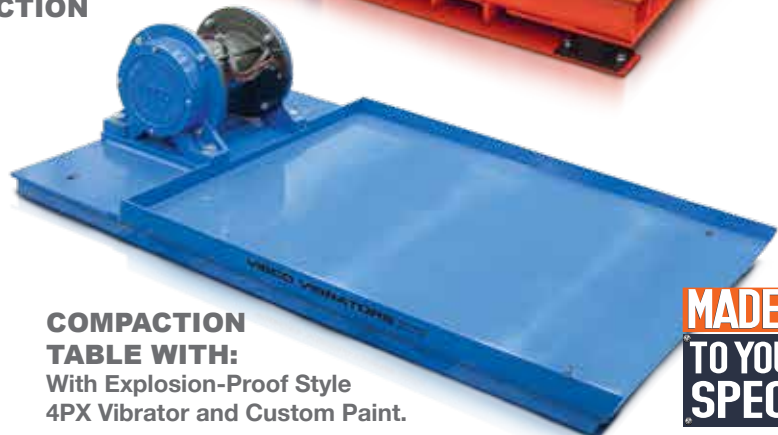
COMPACTION TABLE WITH: With Explosion-Proof Style 4PX Vibrator and Custom Paint.